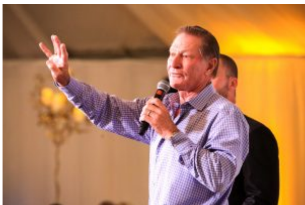
Angel's baseball legend Bobby Gritch