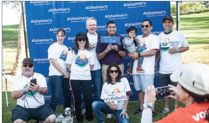
A group of participants pauses for a photo at Saturday's event.