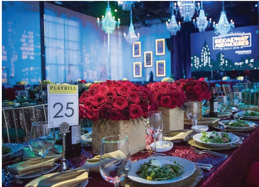
Table decor from the 2016 Alzheimer's OC gala