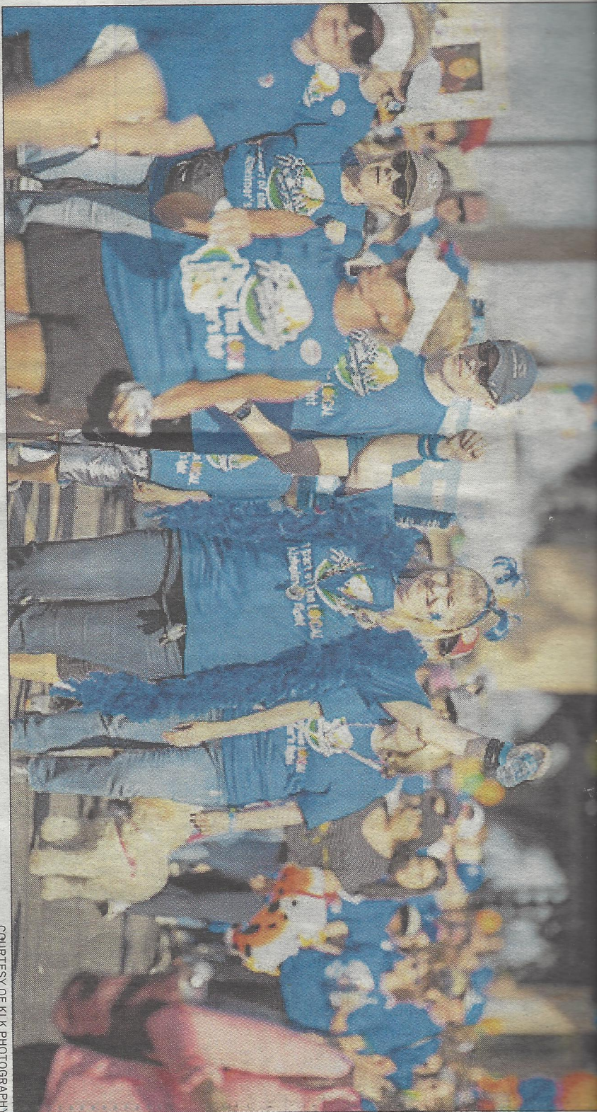
The Walk4ALZ took place at Angel Stadium in Anaheim.

Alzheimer's Orange County is at 2515 McCabe, Suite 200, Irvine. More information can be found at alzoc.org.