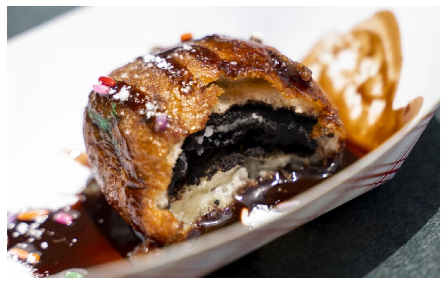
Deep fried Oreo cookies are among the food offerings available to visitors to the Orange County Fair.

Ten Pound Bun served up 7,700 pounds of pizza and avocado toast, while Mom's Bakeshoppe reported using 1 Ton of flour, 2 Tons of brown sugar, more than 100 pounds of margarine, 4,600 eggs and nearly 1.1 million mini chips to bake some 75,900 cookies.