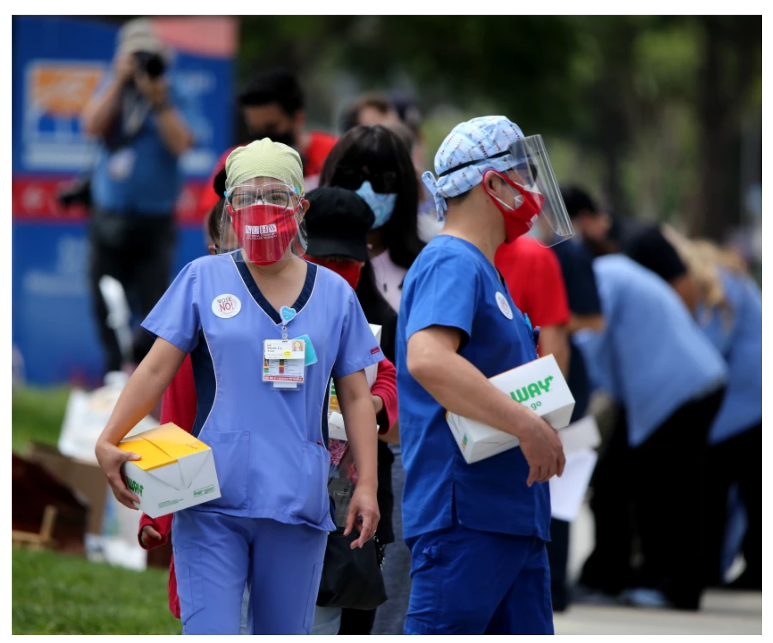
More than 830 healthcare workers at three area hospitals have ratified multiple three-year contracts with employer Tenet Healthcare that aim to increase pay, improve benefits and create safer working conditions, according to a union release issued Thursday.

Represented by the National Union of Healthcare Workers, employees had <u>authorized a</u> <u>strike</u> at Fountain Valley Regional Hospital and Medical Center, Los Alamitos Medical Center and Lakewood Medical Center as part of a wider effort to improve staffing, pay and benefits and COVID-19 safeguards.