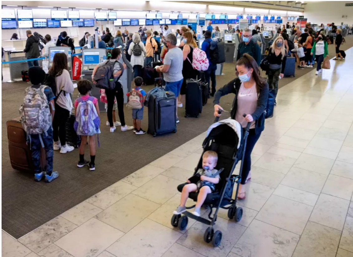
Travelers wait in line during check in at John Wayne Airport in Santa Ana.