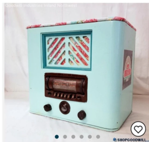
Vintage Top Hinged Storage Trunk Airline Jukebox

🕒 Time Left : 28m 23s (update) | Bids : 1