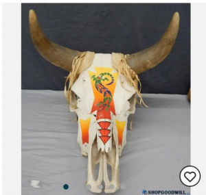
Painted Cow Head(Skull) Southwestern Deco

🕒 Time Left : 23h 11m (update) | Bids : 9