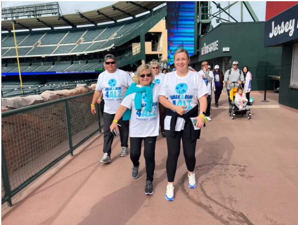
Alzheimer's Orange County's annual Walk4ALZ & Run4ALZ at Angel Stadium drew more than 2,500 people and raised $300,000.